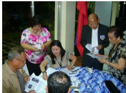
↑ Newsletter production line