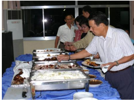
PP Ed leads the pack