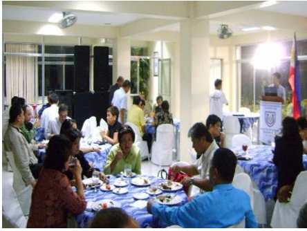
Large attendance included RCNMHers, spouses, guests and Rotarctors