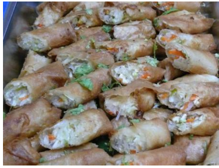
Yummy Lechon and Spring rolls!