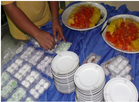
Dessert -flavored buchi & fresh fruits