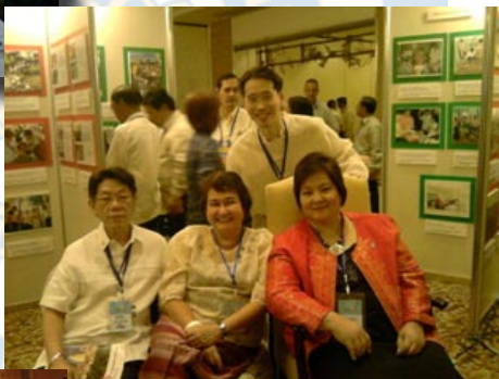
The RCNMH Project Fair delegation share a light moment