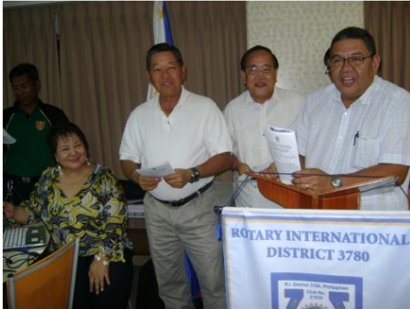
Trio los Panchos singing "Smile" to the delight of Pres Baby