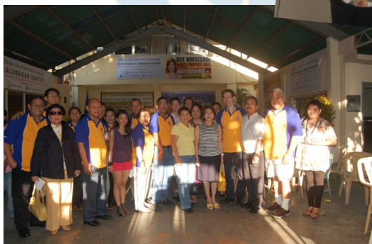
The gallant members of the Rotary Club of New Manila Heights