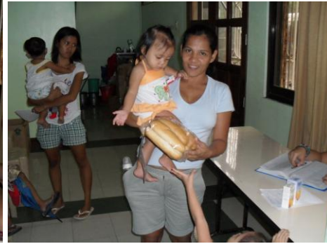
SHARING OUR BOUNTY -Distributing bread to patients at the Mt Carmel Shrine Community clinic, Barangay Mariana, New Manila, Quezon City