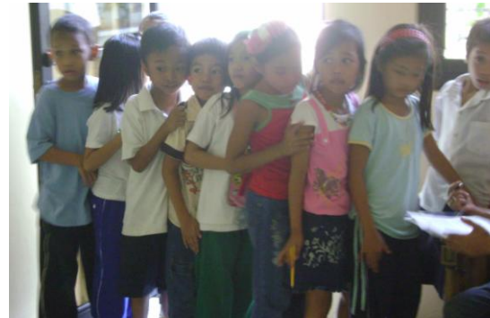
Queueing and waiting for names to be called