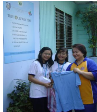
Interactors gladly receive RCNMH donation of T-shirts for their use during the District gift-giving to National Children's hospital patients on Dec. 4 where they will be doing interpretative dancing