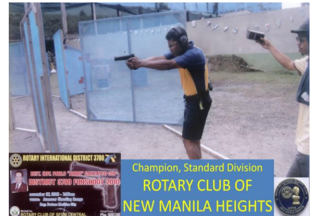
Champion, Standard Division ROTARY CLUB OF NEW MANILA HEIGHTS