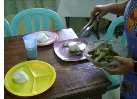
Food presentation is important too

Menu for the day: Sinigang na isda sa miso