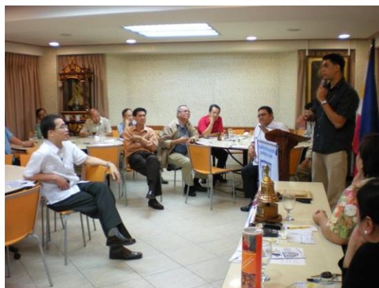
RCNMHers listening intently to the ins and outs of refereeing in professional & amateur basketball in the Philippines