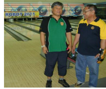
May 29 - ROBOT - Bowling Tournament E-Lanes