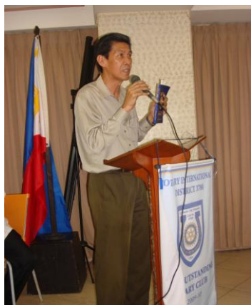
1-PP Boy -Rotary Information