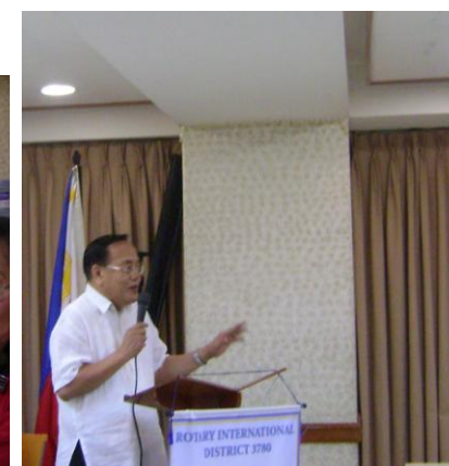
4-Rtn Amba Al -4-Way Test sharing