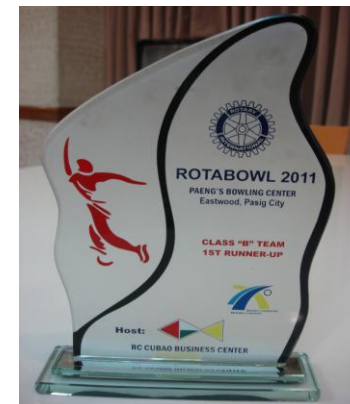
2 nd place Trophy for RCNMH in Class B of Rotabowl 2011