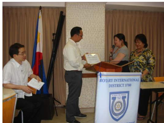
Plaque of appreciation to Speaker from Alveo Land and his group