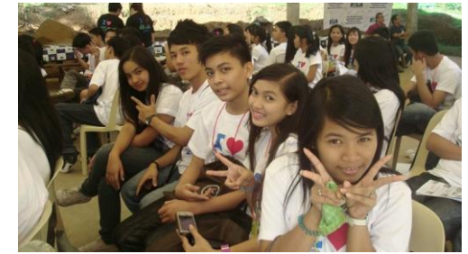
4 delegates from PBHS Interact were sponsored by RCNMH to attend the 23 rd RYLA Camp held in Antipolo last January 31, 2011