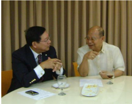
A chat between two PDGs