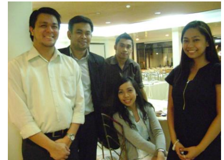
RCNMH members pose with Guest Speaker after the meeting ↓