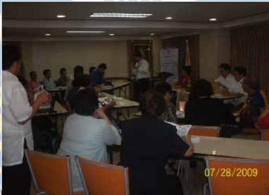
Another packed Peñafrañcia Hall during the last Club Meeting on July 28, 2009