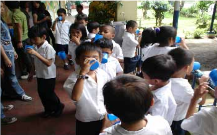
Another day of milk feeding and making a difference in the lives of the underprivileged in our community