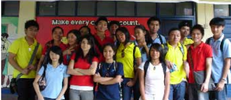
The Rotaract volunteers strike a group pose after a hard morning's work of milk feeding at the P. Tuazon and P. Bernardo Elementary Schools