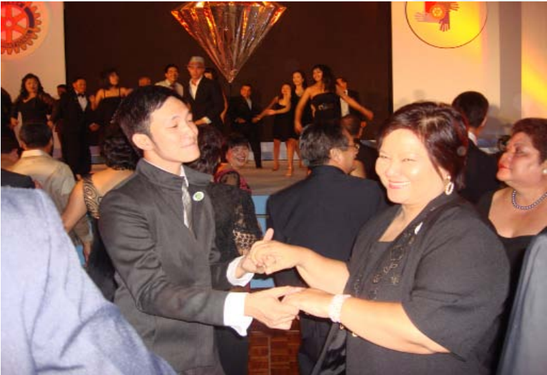
PE Baby displaying her dancing talent